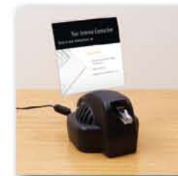
TA-6410 | DeskBridge G

For a more hidden option, this compact model mounts under the desk, providing wireless access throughout the room, and an Ethernet connection socket.