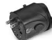
Swiss World Travel Adapters