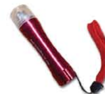
Emergency Phone Charger