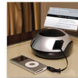
TA-7100 | AudioSpool™

Features a 1.8m (6 ft) retractable audio jack cable. Guest can access their own music by pulling the cable out to connect it to their laptop, MP3 player, iPod® or iPhone®. The cable retracts back in place when done.