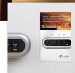
■ Wall Mount

Our durable, acrylic DeskCards come in a variety of styles and sizes