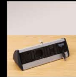
■ 84 Series Harmony*