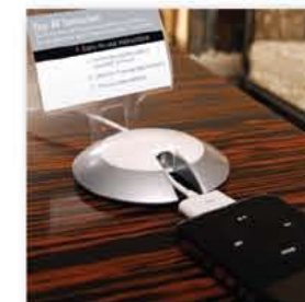
TA-7300-01K | AV Pull-Through™

Features a 1.8m (6 ft) retractable audio jack cable. Guest can access their own music by pulling the cable out to connect it to their laptop, MP3 player, iPod® or iPhone®. The cable retracts back in place when done.