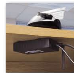
TA-8000 | Under Desk

Provides wireless access throughout the guestroom just by plugging it into an existing Ethernet socket. An Ethernet connection socket for non Wi-Fi guests, or guests who simply prefer to plug in. Customize this product with your logo as well.