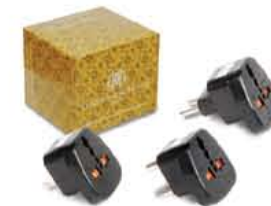
Power Adapters for the Following Countries:

Australia Italy Denmark South Africa European Large Pin Switzerland European Small Pin UK India/Asia USA/Canada Israel/Egypt USA/Japan