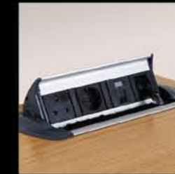
■ 85 Series Affinity*