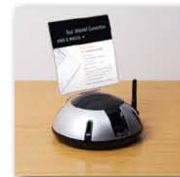
TA-7900 | DeskPoint RJ45

Provides wireless access throughout the guestroom just by plugging it into an existing Ethernet socket. A 1.8m (6 ft) retractable Thinline cable for non Wi-Fi guests, or guests who simply prefer to plug in. Customize with your property's logo.