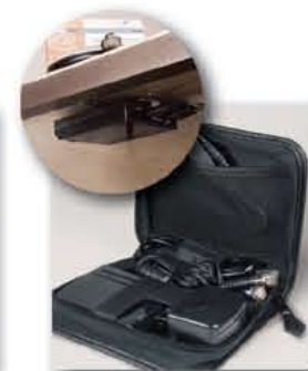
TA-6450 | TravelBridge G

Provides a wired connection point for wireless networks by converting the wireless signal to an Ethernet cable. A retractable 0.8m (2.5 ft) slimline cable, provides Internet access for laptops without Wi-Fi technology.