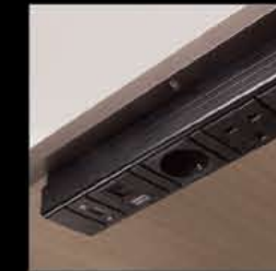
■ 89 Series Conti*

*These products not available in the US or Canada