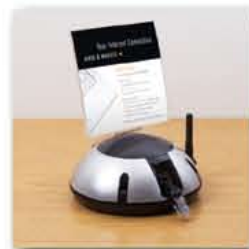
TA-6900 | DeskPoint™

If you're wired for high-speed Internet you can also provide wireless