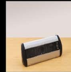
■ 81 Series Wedge Harmony*