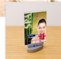
■ Revolving T-Shape