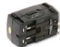
World Power Adapter

Australia Italy Denmark South Africa European Large Pin Switzerland European Small Pin UK India/Asia USA/Canada Israel/Egypt USA/Japan