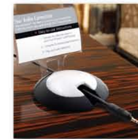
TA-7300K | Audio Pull-Through™

Features an iPod/iPhone 30-pin dock connector. Connects easily to the TV's composite Audio/Video jacks, allowing guests with iPods or iPhones to enjoy their music, videos and movies through the in-room TV.