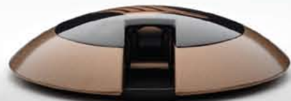
AV Pull-Through™ | iPod Cable Holder

Looking for a clean, compact and stylish way to keep your cables organized and accessible? The CableSitter will hold virtually any cable securely in place such as a printer or Internet cable. Eliminate the clutter.