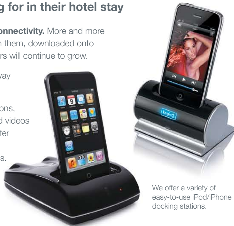
We offer a variety of easy-to-use iPod/iPhone docking stations.

With solutions to fit any budget, you can't afford not to plug your guests in.