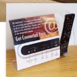
■ Remote Control Holders