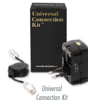
Universal Connection Kit

visit our website to see our complete line