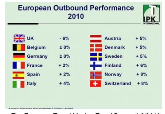
The European Travel Monitor Trend Survey 1-8/2010, based on 100,000 representative interviews, covers 12 major markets that represent 65% of European outbound

The number of Europeans booking travel on the internet rose 17% and is now approaching the 50% level, according to the survey.