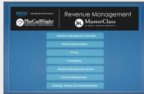
Overview of the Revenue Management topics covered in the class

The Revenue Management MasterClass can help your organization boost its revenue management expertise and optimize results. Contact IDeaS today to learn more.